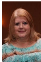
Sharon First Social (937) 667-7256 sfirst@live.com